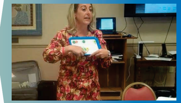
Professional Development for Teachers

apluslit@gmail.com www.aplusliteracy.com